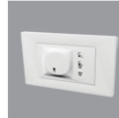
CW529WHI Shaver Socket

Citric hospitality range is smart energy saving specially designed for the hotel industry. It saves energy without compromising the comfort of the guest. Feature packed and with superior aesthetics, Citric range of hospitality products are in complete synergy with the hospitality industry requirements. The range is convenient, safe and efficient.