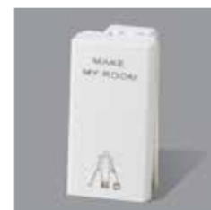
CW415WHI 1 Way Switch MMR - 1M