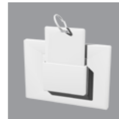
CW527WHI 20A Energy Key Switch with Time Delay